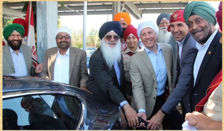
Going Green: Car Charging Station Inauguration