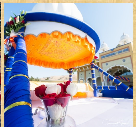
Decorated Float for Sri Guru Granth Sahib