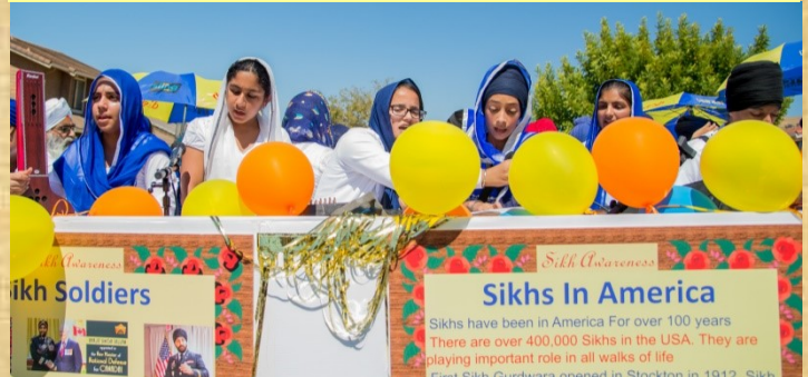
Sikh Awareness Float From GNKS in Nagar Keertan