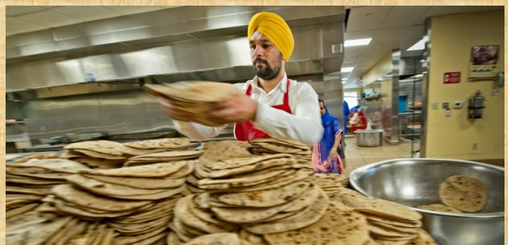
Langar Sewadars Play Most Important Role