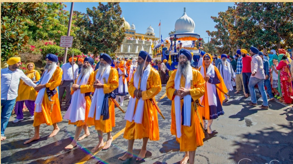
First Nagar Keertan Leaving Gurdwara Sahib led by Panj Pyare